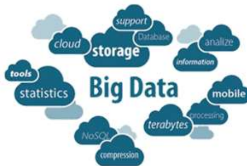
Fig.2 Big Data