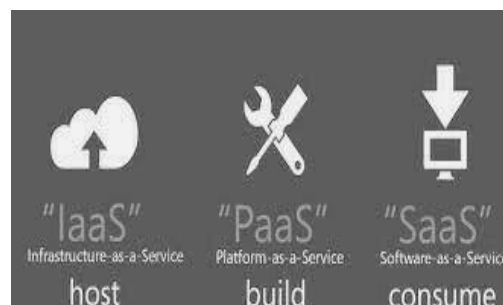
Fig 2: Service Models Of Cloud

The back end consists of resources that provide three standard service models as NIST that are: 1) Infrastructure as a service (IaaS) 2) Platform as a service (PaaS) 3) Software as a service (SaaS)