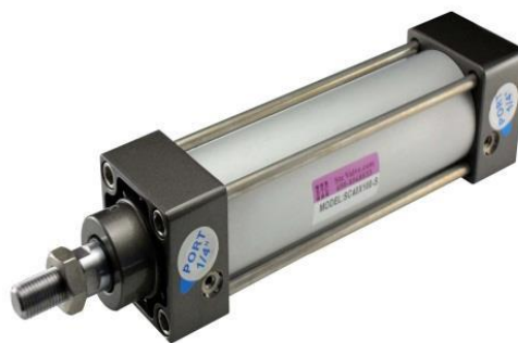
Fig -2: Pneumatic Cylinder