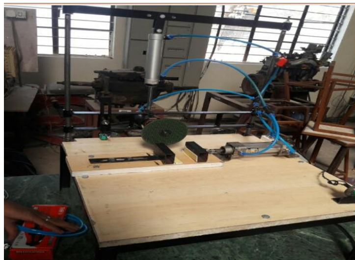
Fig 1:- Pneumatic Pipe Cutting Machine

Today, automation has powerfully entered in the industrial manufacturing process in order to get identical and accuracy of each product by reducing the human involvement. Automatic production is carried out for mass production which is aim at reducing the manufacturing cost of a product. Automatic pipe cutting machine is one of the machines use for bulk production and targets at decreasing the human involvement in order to increase the productivity and accuracy of the product.