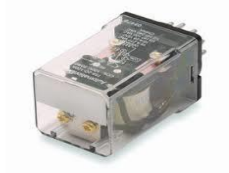
Fig -4: Power Relay