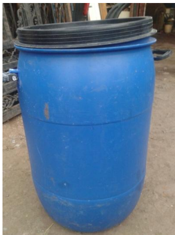
Fig. 1 Circular Tank