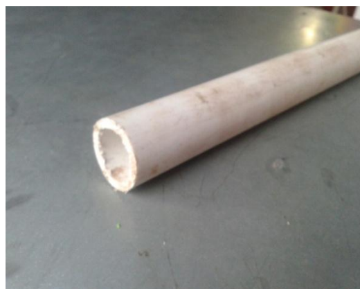
Fig. 2 Interconnecting PVC Pipes