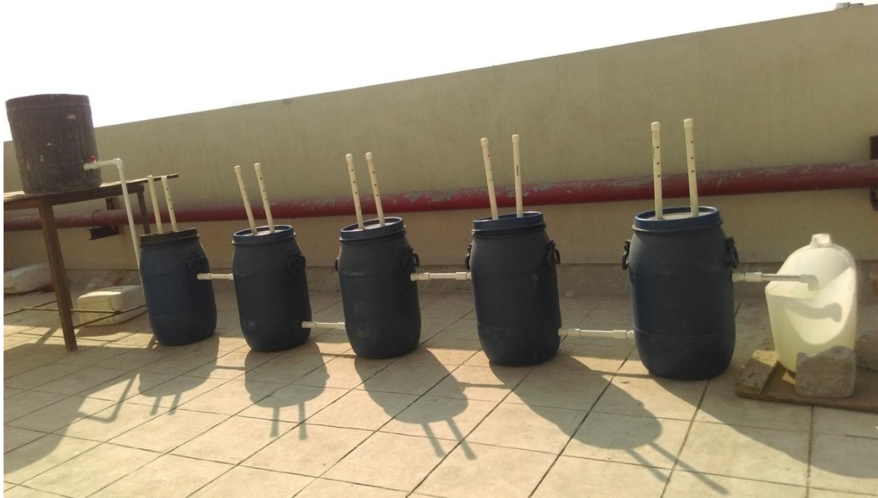
Fig. 3 Actual working model

In the modified stabilization tank the whole arrangement consist of one outlet tank, one inlet tank and five stabilization tank. All the five tanks are connected by the interconnecting pipe. The tanks are placed with equal distance from each other. Two vent pipes are provided for each tank to provide fresh oxygen in the tank and to remove all the foul gases. All the five tanks are provided with the alternative up and down flow.