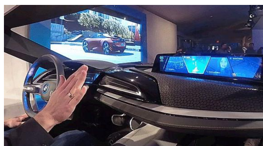
Fig. 3 Gesture Control in cars

It can also be used to detect drunkenness and drowsiness. An infrared camera is mounted on the steering wheels cars. The camera maps the human face to detect whether the driver is drowsing off to sleep or watching away from the road. In conjunction with a radar system, this technology will enable the car to deploy safety airbags quicker in case it detects an imminent collision. It could also be made to apply brakes or alert the driver through speakers or vibration.