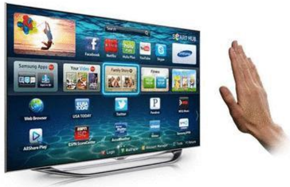
Fig. 2 TV Control using hands

Most videogames today are played either on game consoles, arcade units or PCs, and all require a combination of input devices. Gesture recognition can be used to truly immerse a players in the game world like never before.