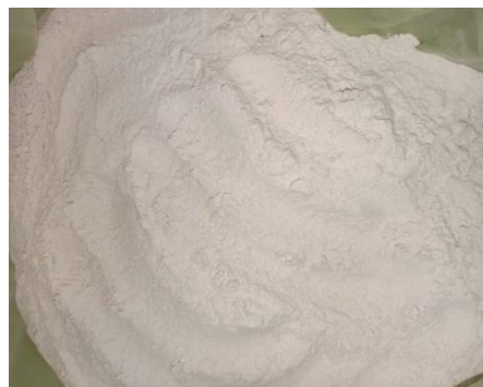
Fig 3 Marble powder

Marble is a metamorphic rock resulting from the transformation of a pure limestone. A large quantity of marble powder is generated during the cutting process. The result is that the mass of marble waste which is 20% of total marble quarried has reached as high as millions of tons. Leaving these waste materials to the environment directly can cause environmental problem. Moreover, there is a limit on the availability of natural resources used for making cement, and it is necessary to reduce energy consumption and emission of carbon dioxide resulting from construction processes, solution to this problem is use of marble powder as partial replacement of cement.