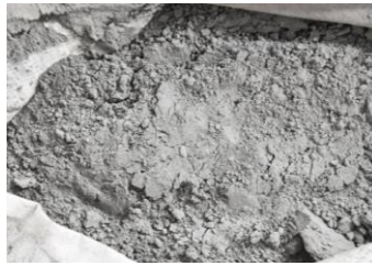
Fig 1: Cement