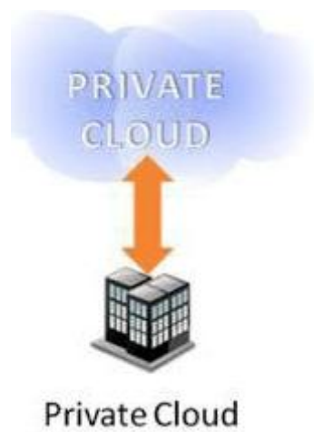
Figure 5 Private cloud