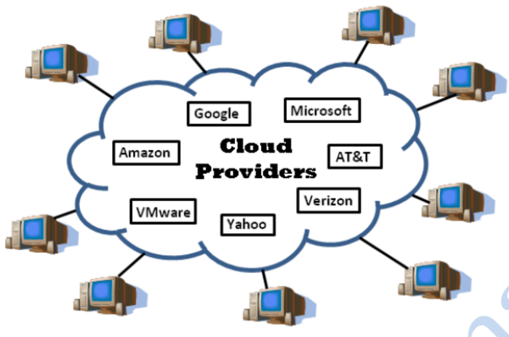
Figure 1 Different Cloud Providers

Sharing resources amongst can improve, as servers are not unnecessarily left idle, which can reduce costs significantly while increasing the speed of application development.