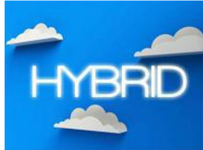
Figure 6 Architecture of Android