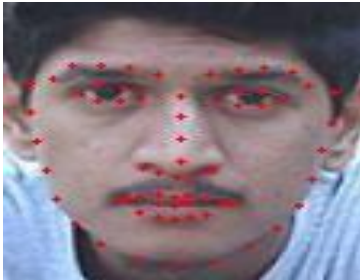
Figure 2: Detecting facial landmarks

The term "pre-processing" refers to the which is related with data based problems such as data table, but in images also there is pre-processing. In images basically there are two types of pre-processing, which area analogue and digital. In this research paper, we will talk about digital image processing which is being used in the model we use. The term "digital image processing" refers to the process of analysing data images through computer methods.