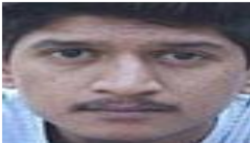
Figure 2: Extract face ROI with OpenCV and Numpy

We can see the flow of our model how it will work in the above figure 1. First an image will be taken as an input in one frame. Then next comes the phase of data cleaning where we try to remove the noise from the data. Then we will apply different pre-processing techniques and then we will split the data in the training and testing batches. After that, the network is generated using the provided data. Finally we will execute our model on static images. And at the end we will test it in real-time using OpenCV.