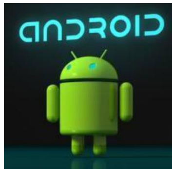
Figure 1 Android main icon

The Alliance currently consists of 34 companies including Motorola, T-Mobile and Sprint-Nextel. These companies have agreed to open access devices. This basically means that I, as a customer, can purchase a Motorola phone with service from one cellular network then later switch carriers but keep the same phone!