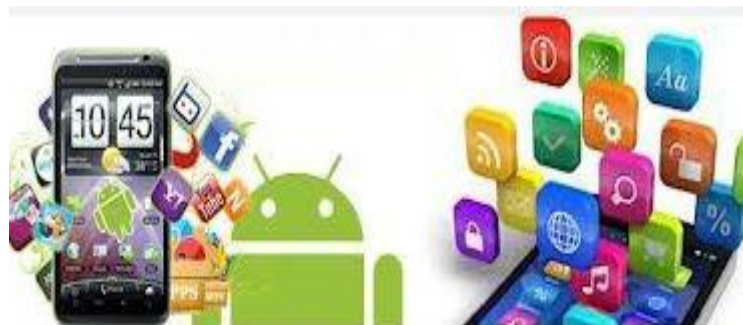
Figure 3 Applications in Android

When you hire our Android developers, you ensure yourself with the most valued and exquisite mobile applications. Our developers can help you eliminate all types of potential risks and gain competitive advantages through their technical expertise.