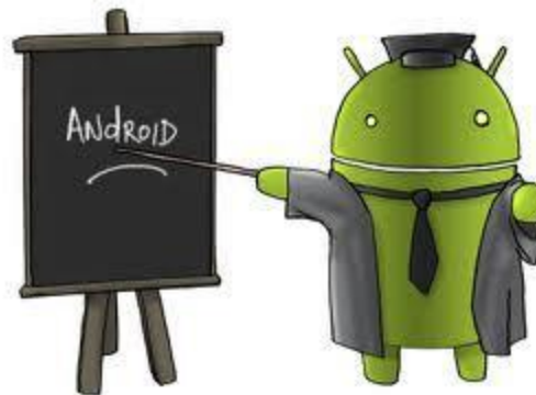
Figure 2 Represent the Android

So in this Mobile world of this complication. Android is one of those operating system platforms which made it easy for manufacturers to design top class phones.