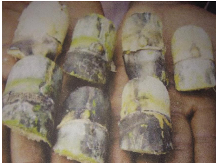
Fig 3: New method