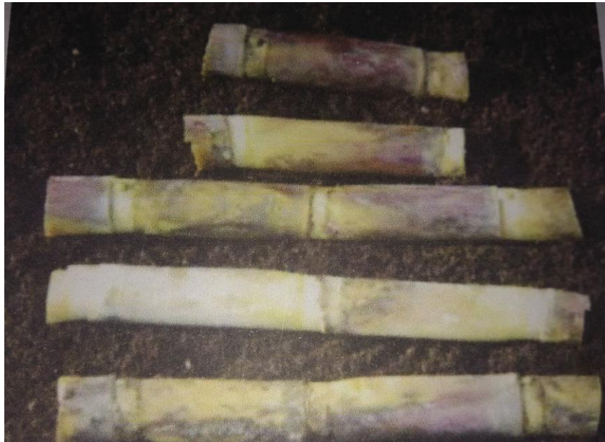
Fig 2: Traditional method