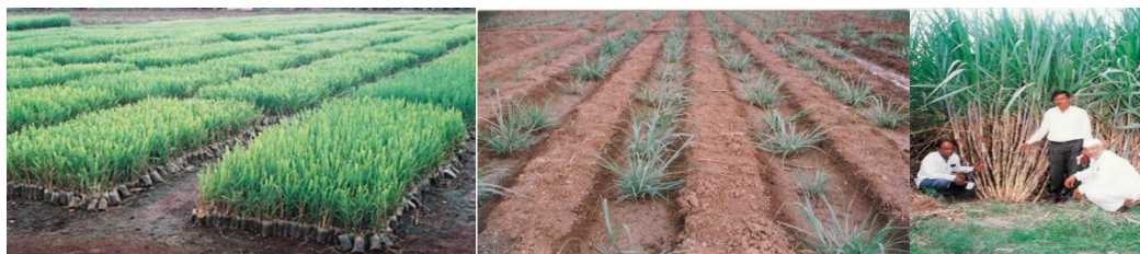
Fig. 9 Hardening outside the greenhouse