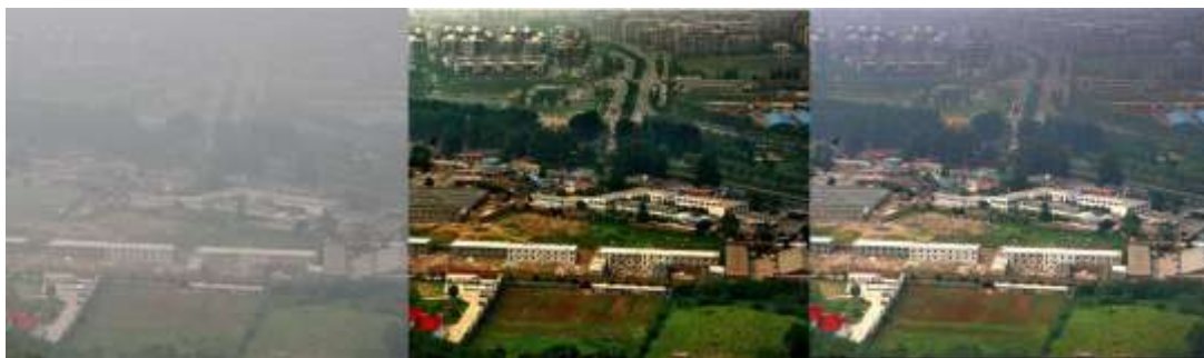
Figure 1 First: Input Image, Second : Result of [2] ,third: Result of [8]

All the above mentioned limitations of Dark Channel Prior were covered in [8] where downsampling/upsampling and guided filter are used along with Dark Channel Prior. The computational time of this algorithm is less than 50 ms so it is well suited for Real-Time Applications.