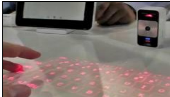
Fig 3 : A model representing virtual Laser Keyboard [5]

An infra-red plane of light is generated on the interface surface. The plane is however situated just above and parallel to the surface. The light is invisible to the user and hovers a few millimetres above the surface. When a key position is touched on the surface interface, the light is reflected from the infra-red plane in the vicinity of the key and directed towards the sensor module.